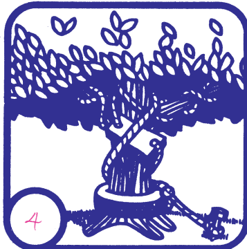
As the Lawyers approved it