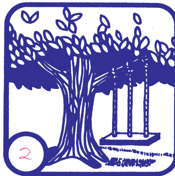
As Production ordered it