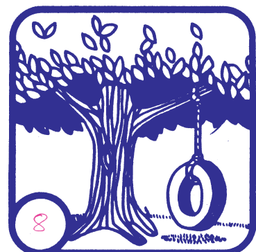
As the Customer wanted it