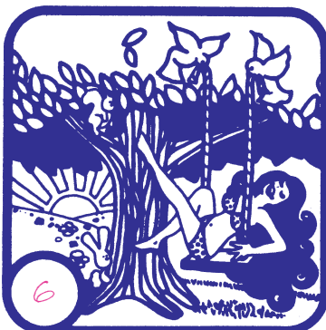
As Advertising promoted it