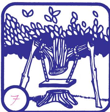
As the Plant installed it